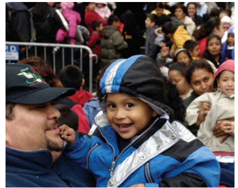
A child eagerly awaits his turn at the toy giveaway